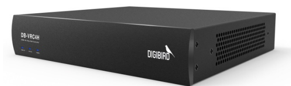
Digibird DB-VRC4H-360F Video Wall Controller

The winner will be announced on the first evening of the ISE show on February 06 during the InAVation Award Gala in Amsterdam.